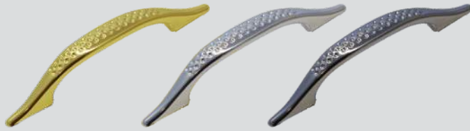
Bow Stipple Handle