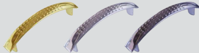
Square Stipple Handle