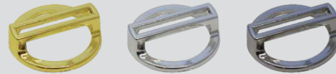
Twin Bar Handle